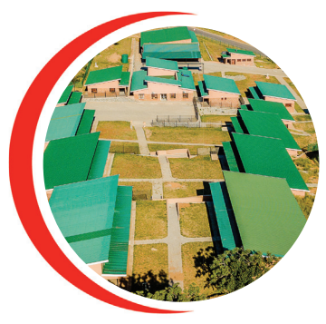
New (Mtfophi) Daantjie Primary School