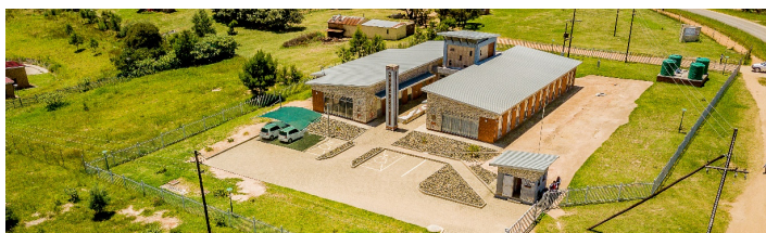
New Glenmore Library