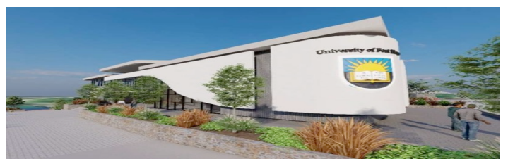
University of Fort Hare Student Centre