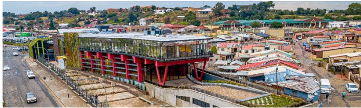
New Westbury Transformation Development Centre