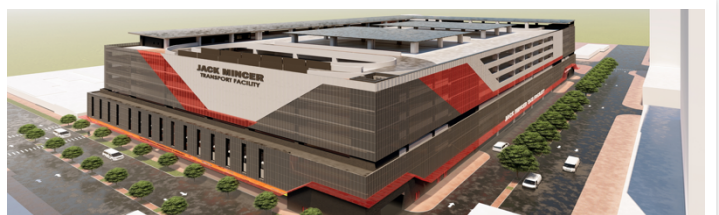
Jack Mincer Transport Facility