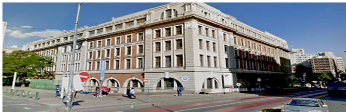
96 Rissik Street Office Building